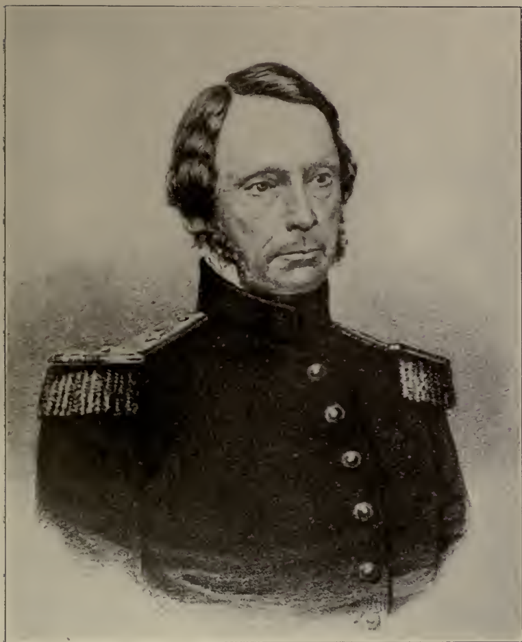
STEPHEN H. LONG.